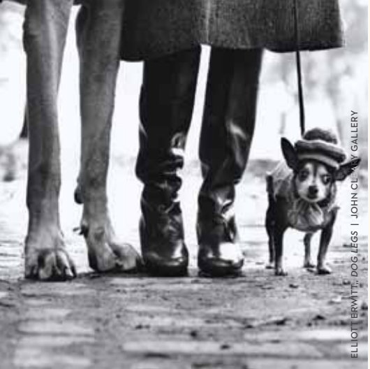
ELLIOT BERWITT | DOG LEGS | JOHN CLAY GALLERY