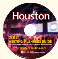
2,500 INTERACTIVE DVDS