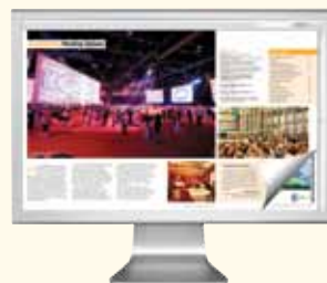
3,000 DIGITAL COPIES/READERS TO MEETING PLANNER READERS