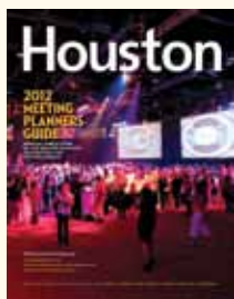
1,500 PRINTED COPIES