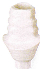
Custom impression coping included