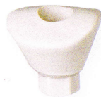
Custom healing abutment included