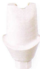
Custom temporary abutment included