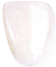
BioTemps® provisional crown included