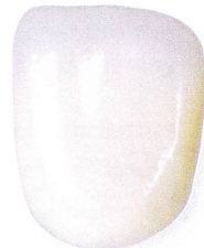
Final BruxZir® or IPS e.max® crown included