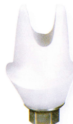
Final custom abutment included