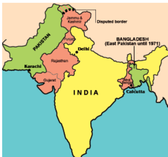
Areas in red show regions of conflict in 1947

Iqbal Hussain The Plan to Partition India and Pakistan Tuesday 3 October 6.30pm-8pm Tooting Library