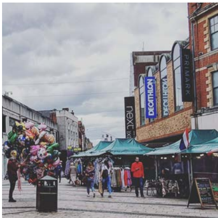
Bromley High Street

Developments predicted before lockdown are now accelerating and will impact on the opportunities available. These include increased working from home, air travel becoming far less frequent due to environmental concerns, more local shopping and supporting local businesses (for business to business and business to consumer transactions), streaming becoming more popular than cinema, boosting the green economy...and many of these trends are not going away.