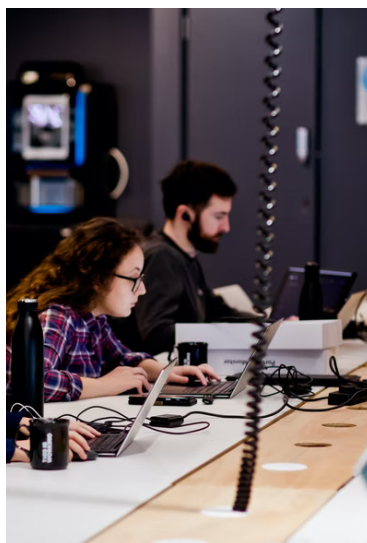
Contingent Works

Above all, we are a community, and all members benefit from tapping into the experience and rich networks of our growing community.