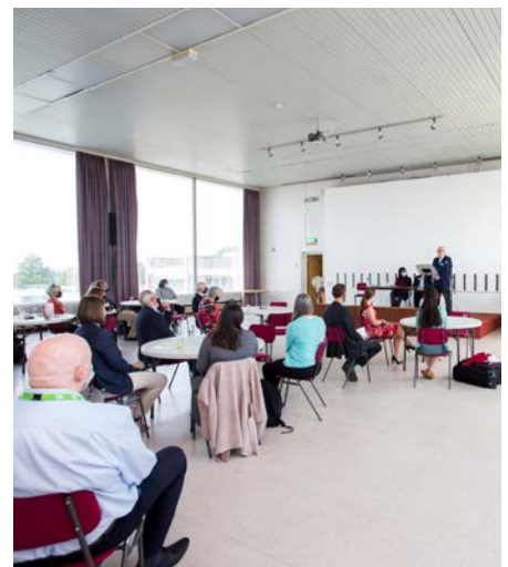
Bromley Library Hall

Registration via Eventbrite is essential.