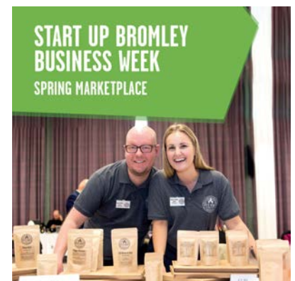
Business Week advertising poster

Visitors need not register! Drop in any time during the day to explore and network.