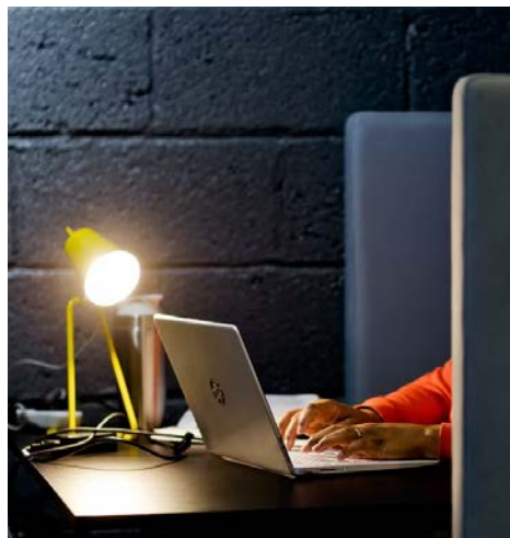
Contingent Works

The future of work is working near home in a safe, flexible, and productive environment. Contingent Works has a mix of spaces to suit all workers' needs and budgets. Plus meeting rooms, podcast studio, phone booths, free refreshments, super-fast wifi, and all within Covid-19 guidelines.