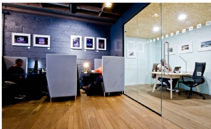
Contingent Works

Instead of the 4th floor of Bromley Central Library, we're happy to inform everyone that we've partnered with Contingent Works for this event. Contingent Works is an office space, not too dissimilar from what we offer, but with a far slicker coat of paint, and in a far more publicly accessible location about two minutes walk from Bromley Central Library, adjacent to the Glades entrance! More information on Contingent Works can be viewed on the following page.