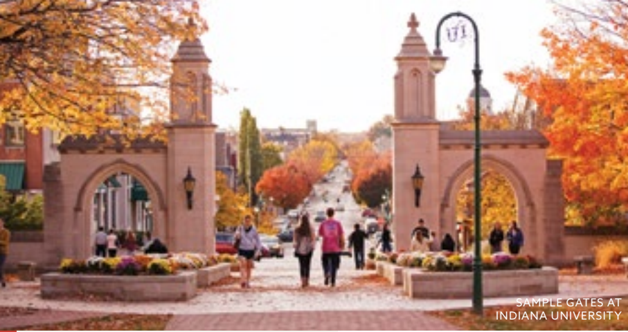
SAMPLE GATES AT INDIANA UNIVERSITY