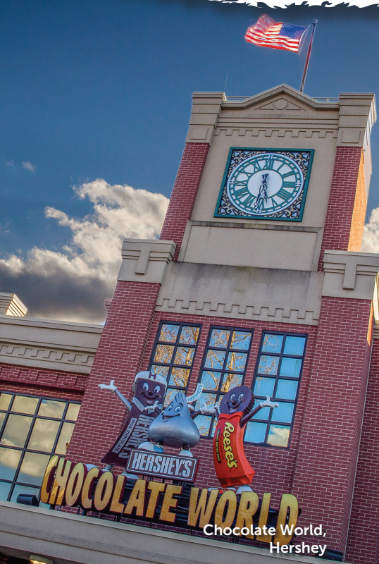
Chocolate World, Hershey

Property names/Trademarked words' are trademarks used with permission.