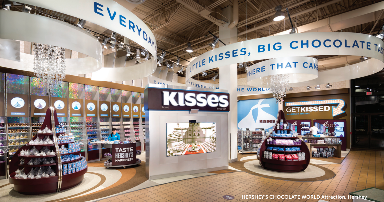
HERSEY'S CHOCOLATE WORLD Attraction, Hershey