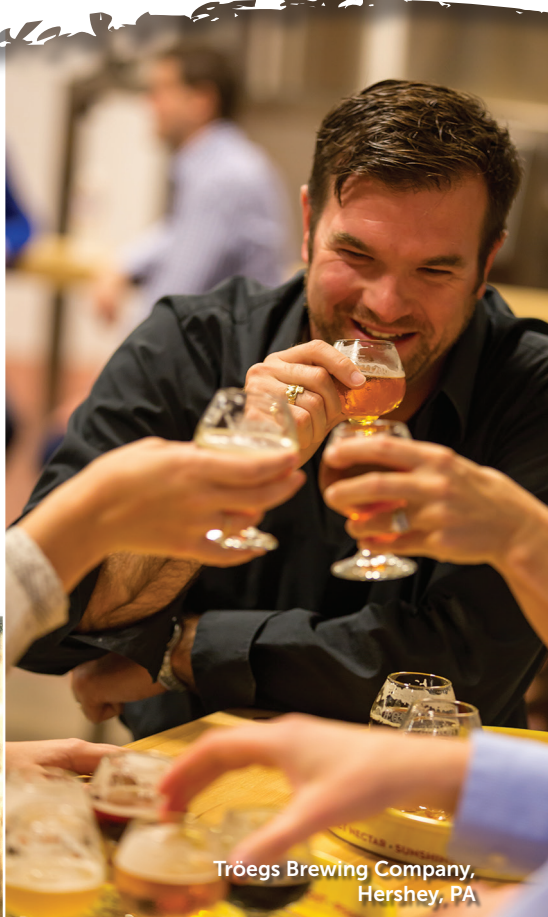
Tröegs Brewing Company, Hershey, PA

Property names/Trademarked words' are trademarks used with permission.