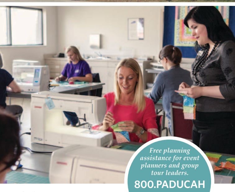
Paducah Signature Experience: A Creative Stitch at the National Quilt Museum