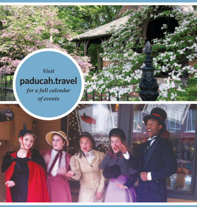
Paducah Main Street Dickens of a Christmas & Small Business Saturday

Paducah's festivals and annual events honor the City's heritage and culture, highlighting each season of the year with celebration. Signature events include AQS QuiltWeek® in both April and September, the Lower Town Arts & Music Festival in May, Barbecue on the River in September and the River's Edge International Film Festival in November. Christmas in Paducah is especially beautiful, when Historic Downtown and Noble Park are in full holiday décor.