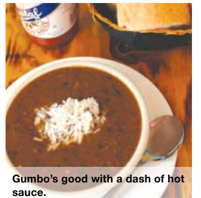
Gumbo's good with a dash of hot sauce.

Though gumbo has popped up on menus across the U.S., you're not likely to get the real thing outside of south Louisiana unless it's cooked by a transplanted native. A dark, flavorful soup, real gumbo takes a long time to cook and requires a little voodoo to do properly; most gumbos are variations on