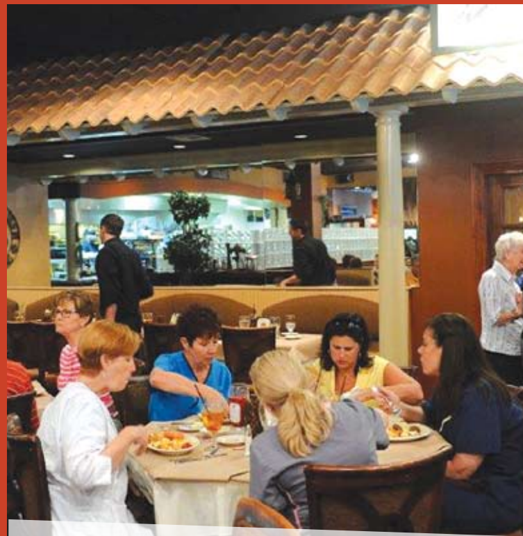
N'Tini's food and martini specials make it a local favorite for gathering with friends.

► Tie up the boat at Madisonville Bridge and walk over for hand-tossed pizza, daiquiris, beer and wine. Hot boiled peanuts and boudin, too.