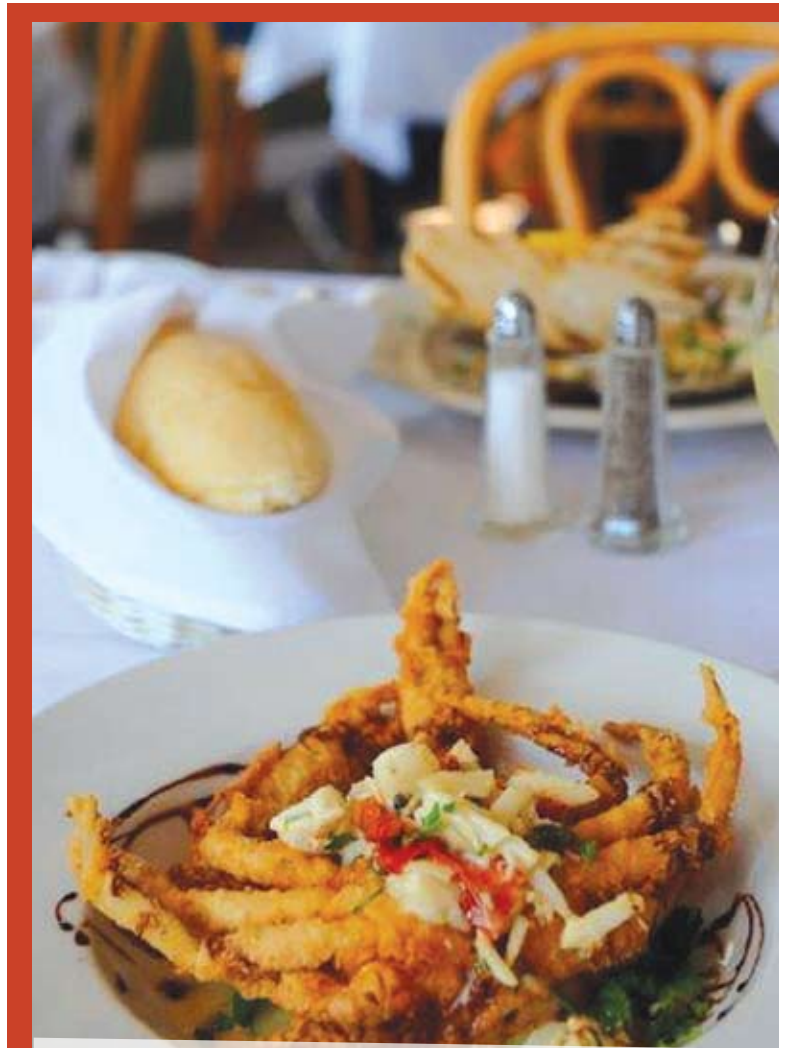
The fare is fresh and flavorful at Madisonville's Water Street Bistro.

► Sushi, sashimi, soups, salads and tempura. Lunch specials and a la carte.