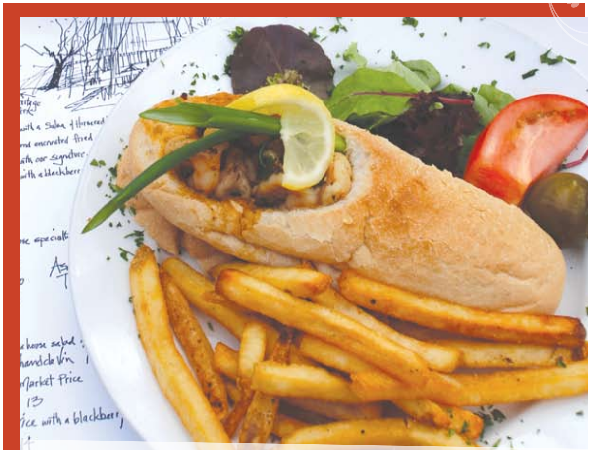
Palmettos combines two of south Louisiana's favorites — barbecued shrimp and the po-boy — in its popular sandwich.

Besh likes it here. The talented, Northshore-born celebrity chef is just one reason you will, too.