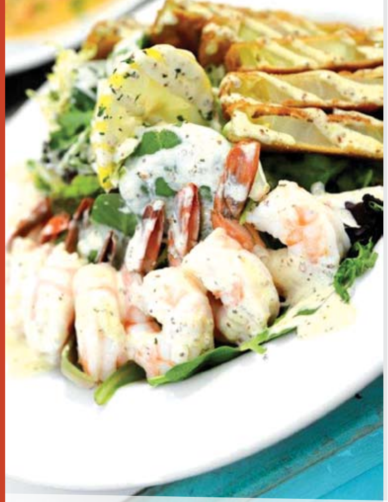
Fried green tomatoes and shrimp are transcendent at Liz's Where Y'at Diner.