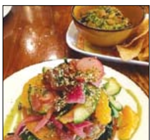
LET'S EAT Find great spots to eat like BacoBar in dining listings. PAGE 14

PRSRT STD U.S. POSTAGE PAID PERMIT #253 MANDEVILLE, LA