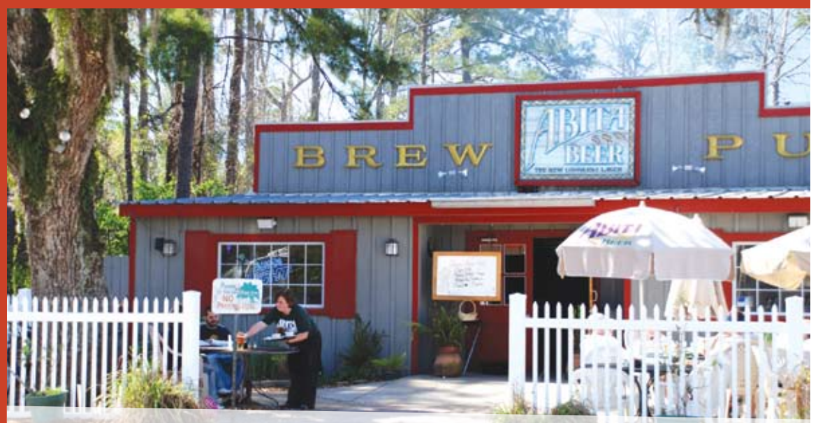
Have a burger or tasty gyro and a flight of Abita Beer at the Abita Brew Pub.

► Chinese specialties for dine-in, to-go, or delivery.