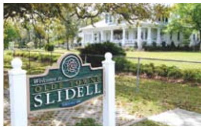
This sign in front of the historic Salmen-Fritchie House welcomes visitors to Olde Towne.

Slidell from the start has been about progress and moving people from one place to another. The same is true today, as the city of about 32,000 sits at the intersection of three interstates – I-59, I-12 and I-10 – that carry millions of people through the area every year. Some are on their way to the Mississippi Gulf Coast or to the plantation country south of Baton Rouge, both about an hour’s drive away. Many are headed for the Big Easy, a 30-minute drive from the heart of Slidell. Those that take the time to stop and explore, to get off the interstate and poke around, will find that Slidell is itself a destination.