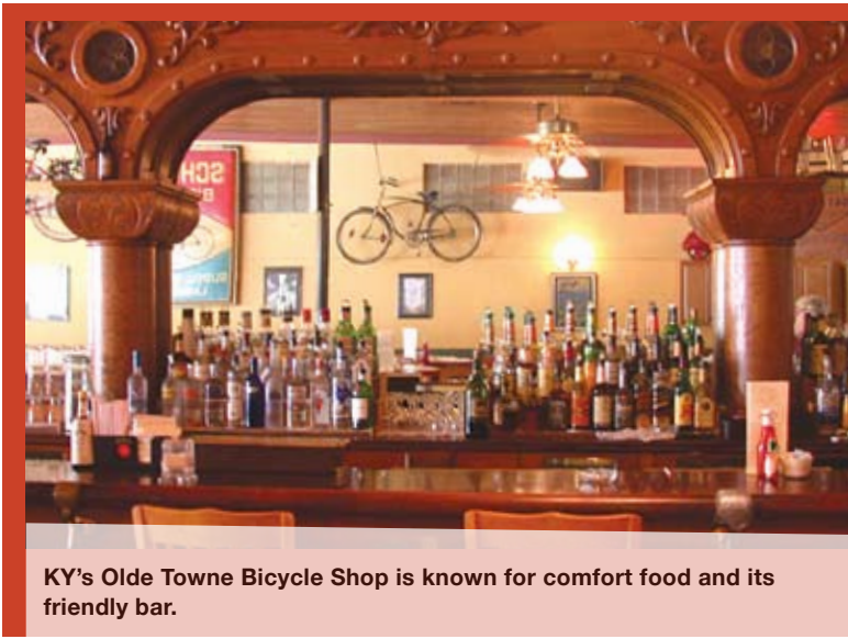
KY's Olde Towne Bicycle Shop is known for comfort food and its friendly bar.