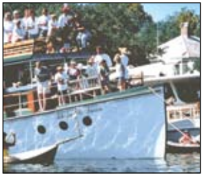
HOPE FLOATS All aboard for Madisonville's Wooden Boat Fest. PAGE 10