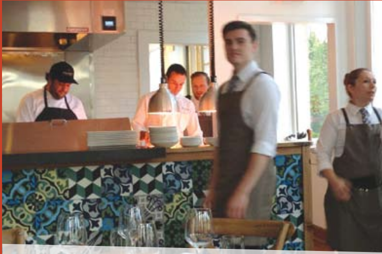
Enjoy Gulf-inspired Southern fare at the lovely Oxlot 9.