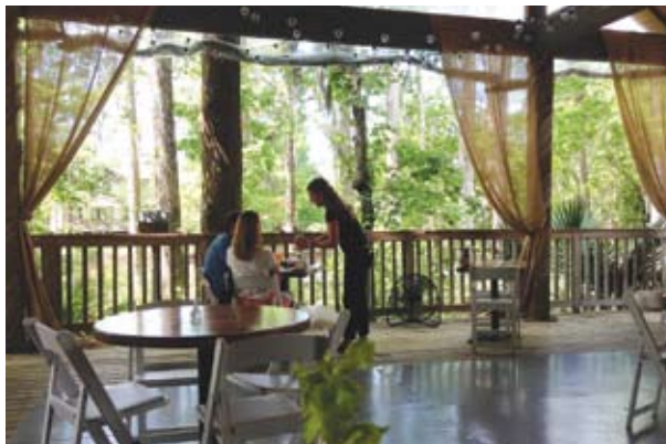
Left: Palmettos’ beautiful decks overlook scenic Bayou Bonfouca.

old-timey banana splits and more. The shop makes all its own ice cream with flavors like Creole cream cheese, Ponchatoula Strawberry and Bananas Foster.