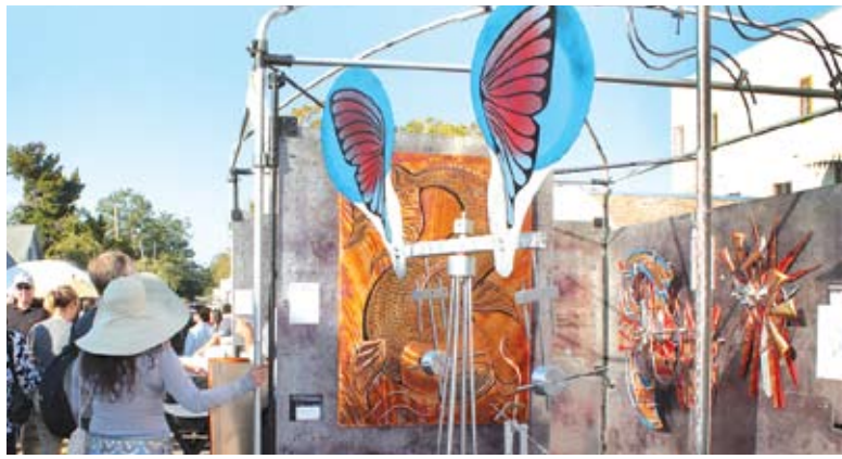
The open-air Three Rivers Arts Festival features the juried works of almost 200 regional artists.