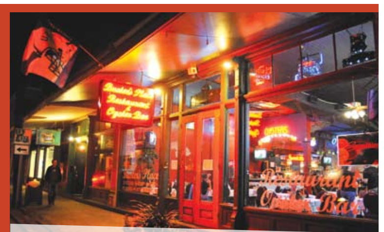
Buster's Place in downtown Covington is known for oysters and Louisiana specialties.

► Sandwiches and meat plates with Texas-style brisket, Southern pulled pork, ribs, and sides.