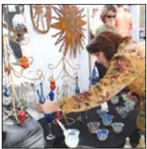
ART AND ALL Downtown Covington gets ready for 3 Rivers Art Festival. PAGE 11