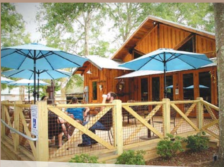
Enjoy specialty coffees, panini and pastry at the new and lovely Western-themed Giddy Up coffee house in Folsom. Great deck out back.