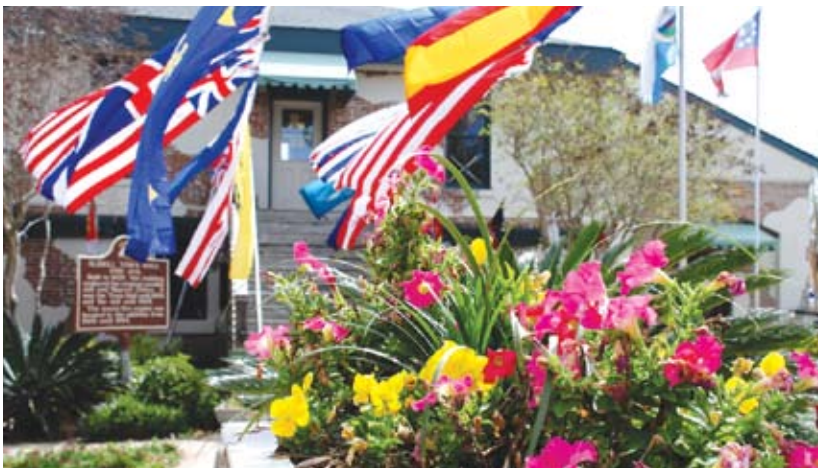
Above: The Slidell Museum is housed in the town’s former city hall and old jail, built in 1907.

This nostalgic little treasure serves up happiness to kids of all ages. Mr. Frank scoops out sweet memories in the form of nectar sodas, chocolate malts,