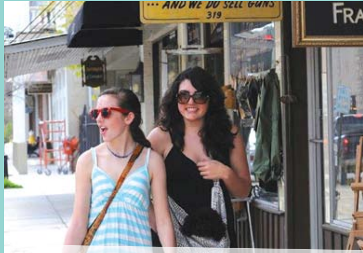
Shopping is a favorite pastime in the walkable historic district of downtown Covington.

River Chase Shopping Center I-12 and Hwy 21 (985) 898-2022