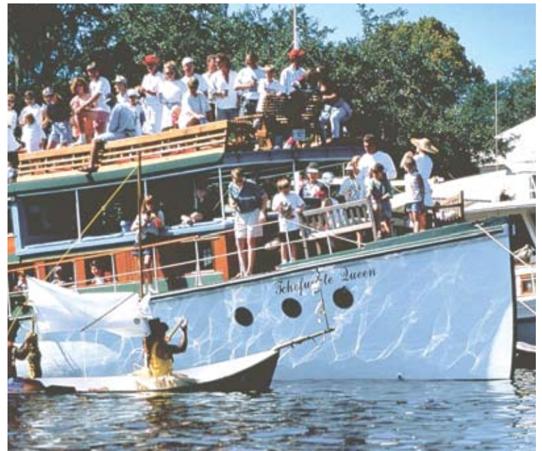
Vintage boats, a wacky boat-building contest, food and music all make the Madisonville Wooden Boat Festival a favorite fall event.