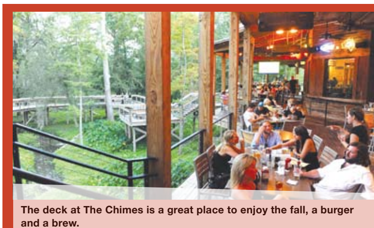
The deck at The Chimes is a great place to enjoy the fall, a burger and a brew.

27470 Hwy. 190 (985) 882-7575 ► Daily lunch specials, smoked ribs, seafood, po-boys, pizza, burgers and more.